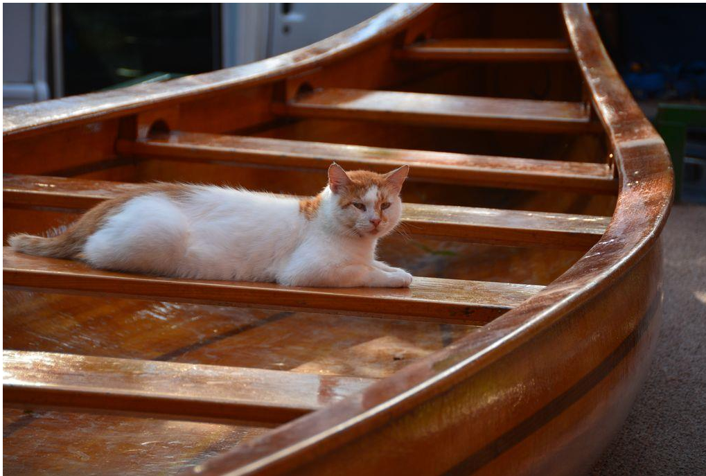
RIP: Shady Cat