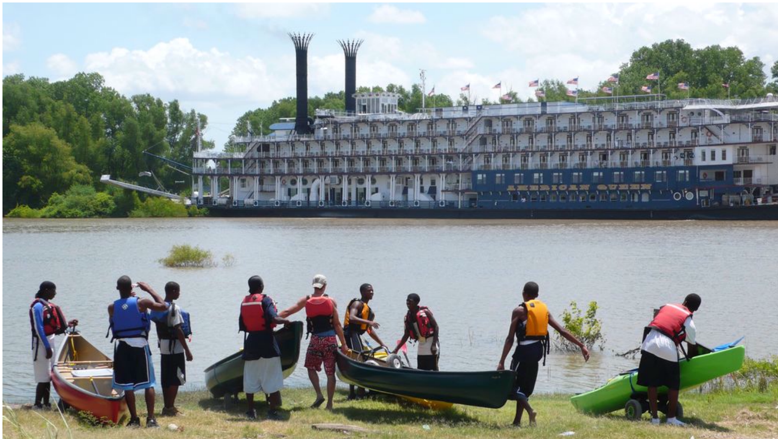
The Mighty Quapaws and the American Queen in the Helena Harbor (2008,)