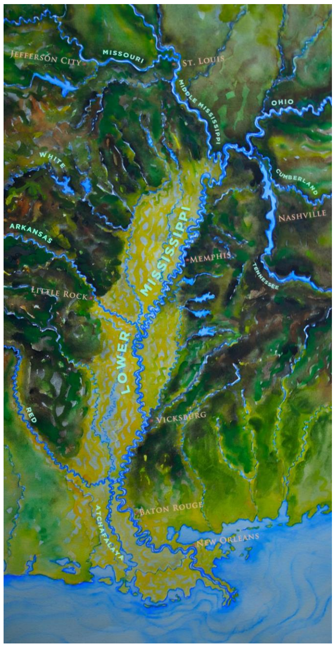
Middle/Lower Mississippi River 3' x 5' watercolor by Driftwood Johnnie