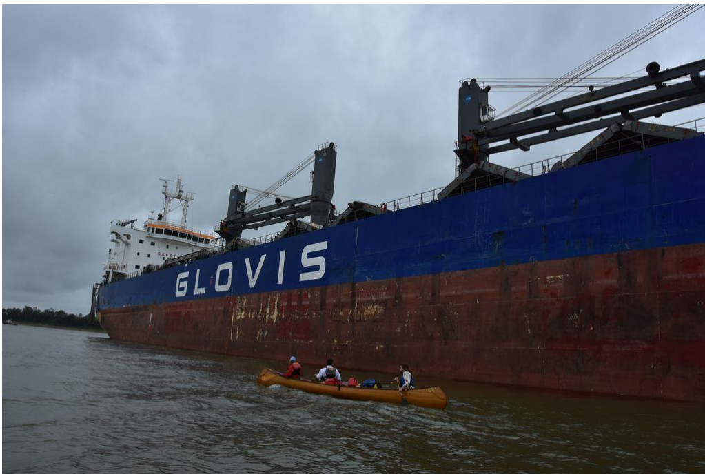
Paddling past one of the many moored Freighters

We continue on to Burnside Bend, making our pick-up point. We paddle past the Sunshine Anchorage , a designated mooring spot for ocean-liners to anchor.