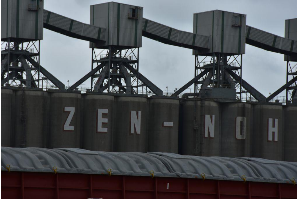
The huge complex at Zen-Noh Grain Corp

We make the Rich Bend Crossing , to Rich Bend, to College Point, and on to the Belmont Crossing. On the east bank is the town of Wallace and the west bank is Paulina.