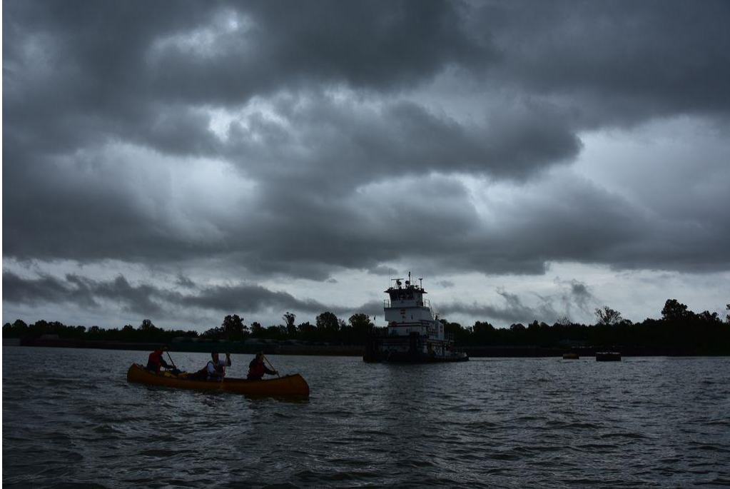
Paddling into Headwinds and past a curious Towboat Pilot

As we paddle on headed to St. Alice Bend, the head wind increases to 20 miles per hour, making us earn every bit of progress.