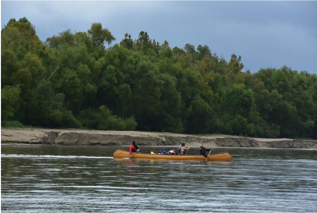
Paddling below College Point

We continue on to Burnside Bend, making our pick-up point. We paddle past the Sunshine Anchorage , a designated mooring spot for ocean-liners to anchor.