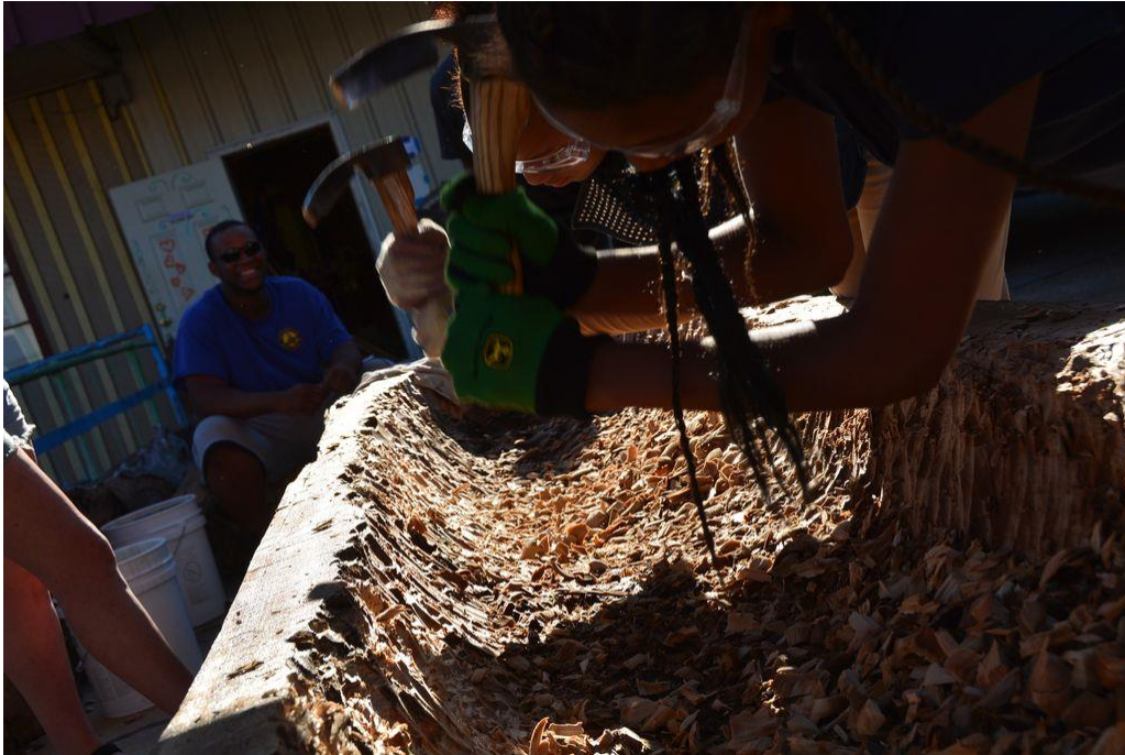
Little Spring Carving Dugout Canoe