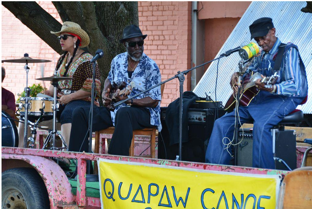
Quapaw Canoe Company Stage at Sunflower Fest