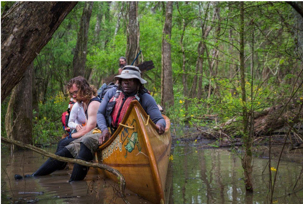
Atchafalaya Expedition