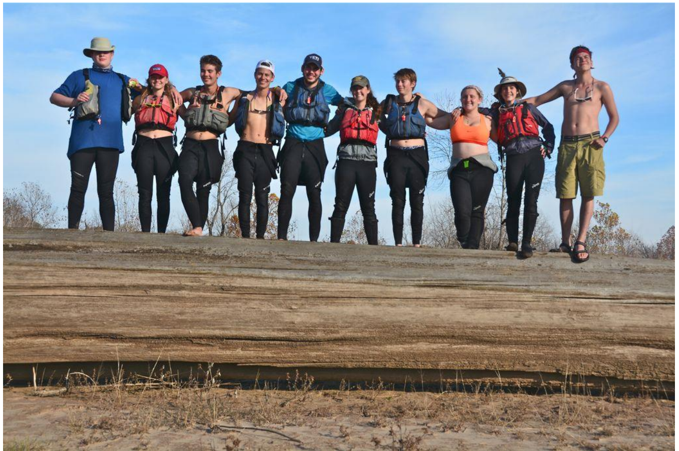
Proctor Mountain School - giant log on Lower Arkansas River