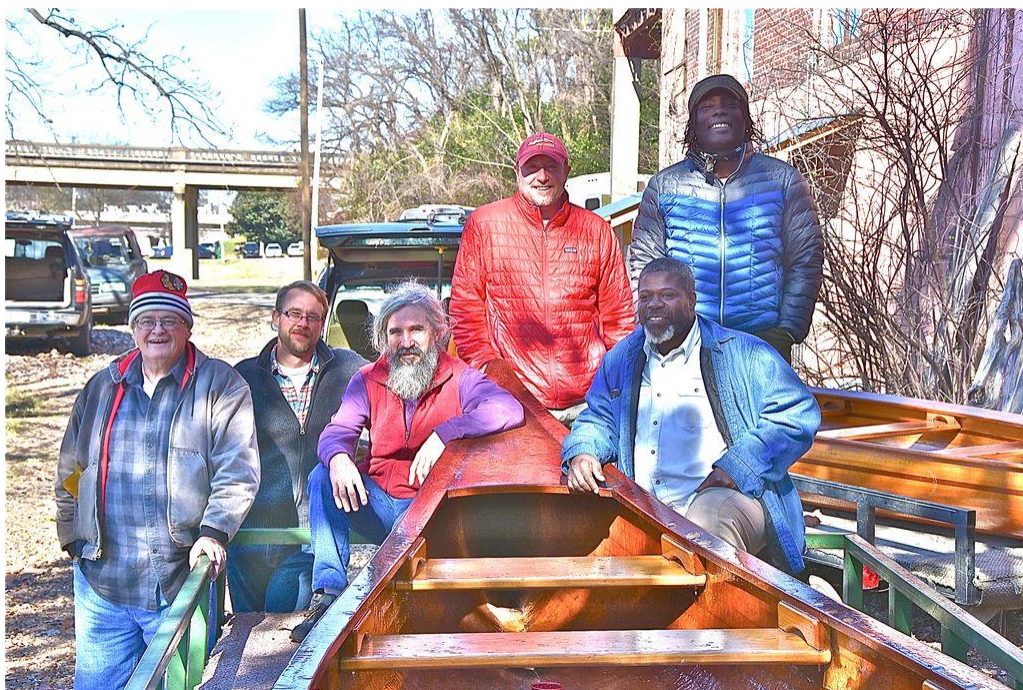
Leaders of all the Quapaw bases