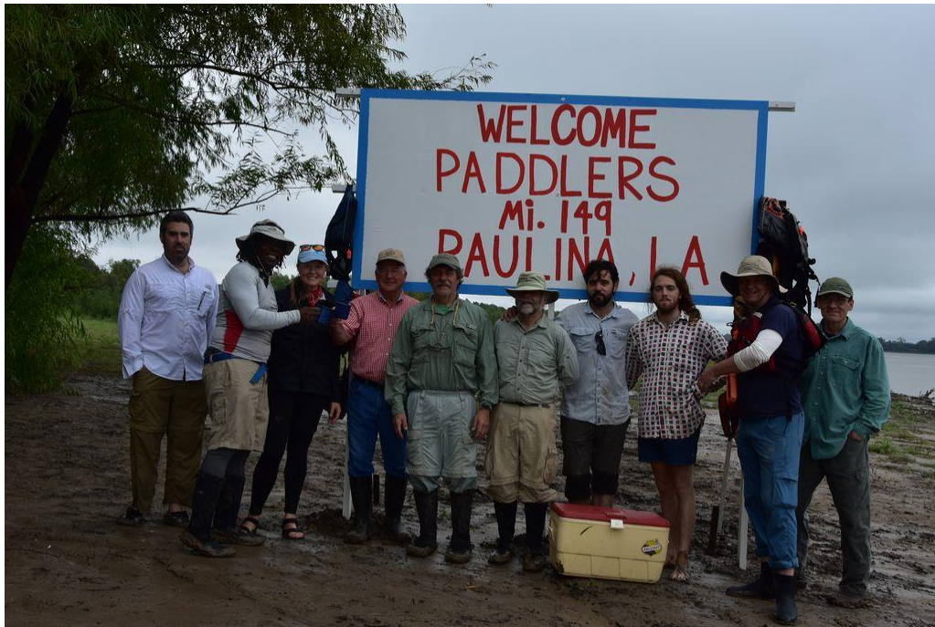
Poche Park - Baton Rouge to Gulf Expedition