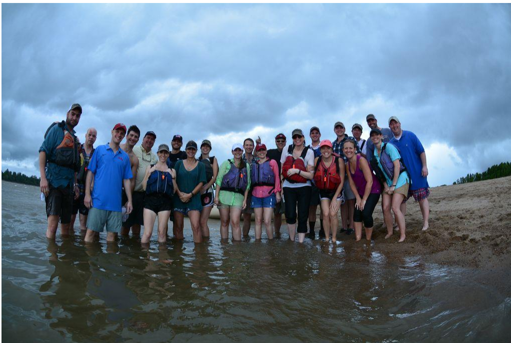
Recess on the River