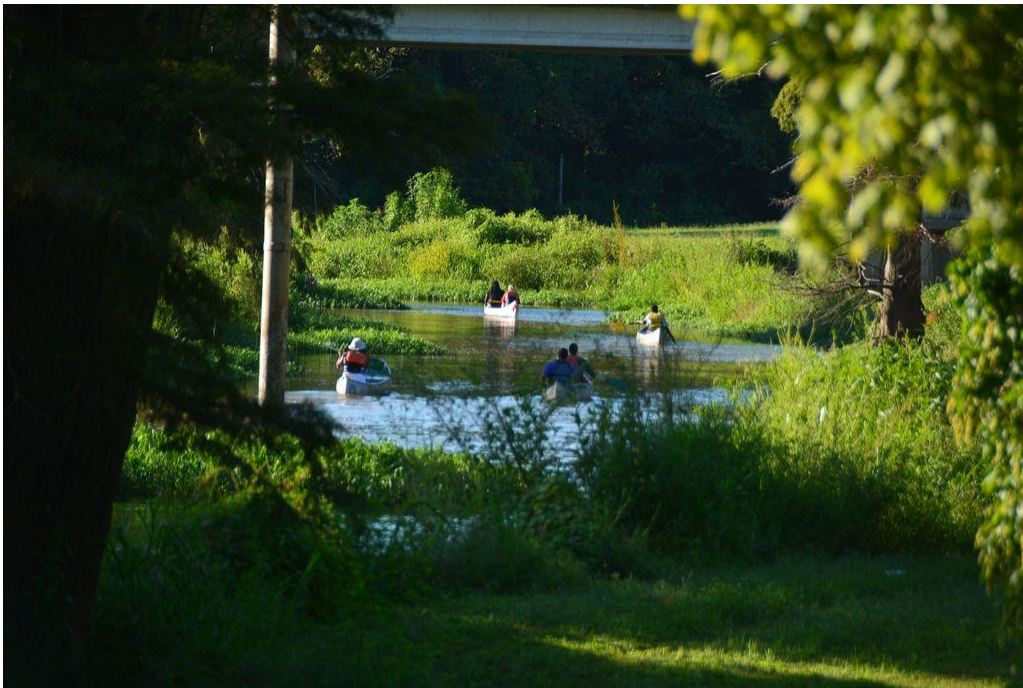
GRIOT River Arts