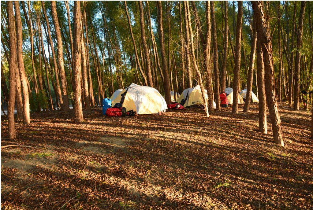
Willow Camp (Augsburg College River Semester 2015)