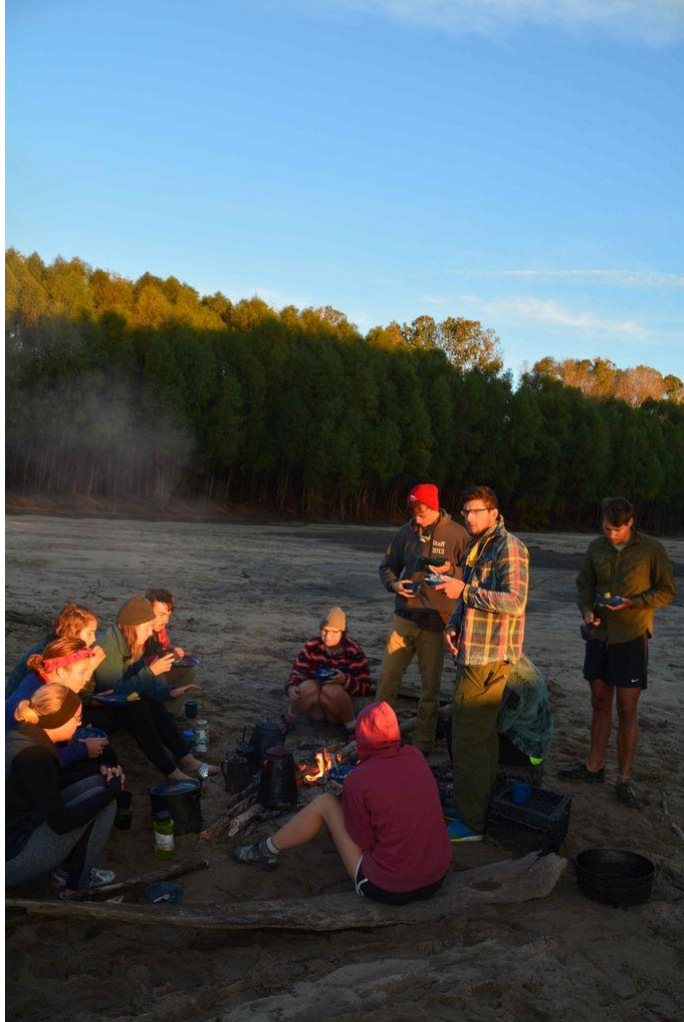
Evening Seminar (Augsburg College River Semester 2015)