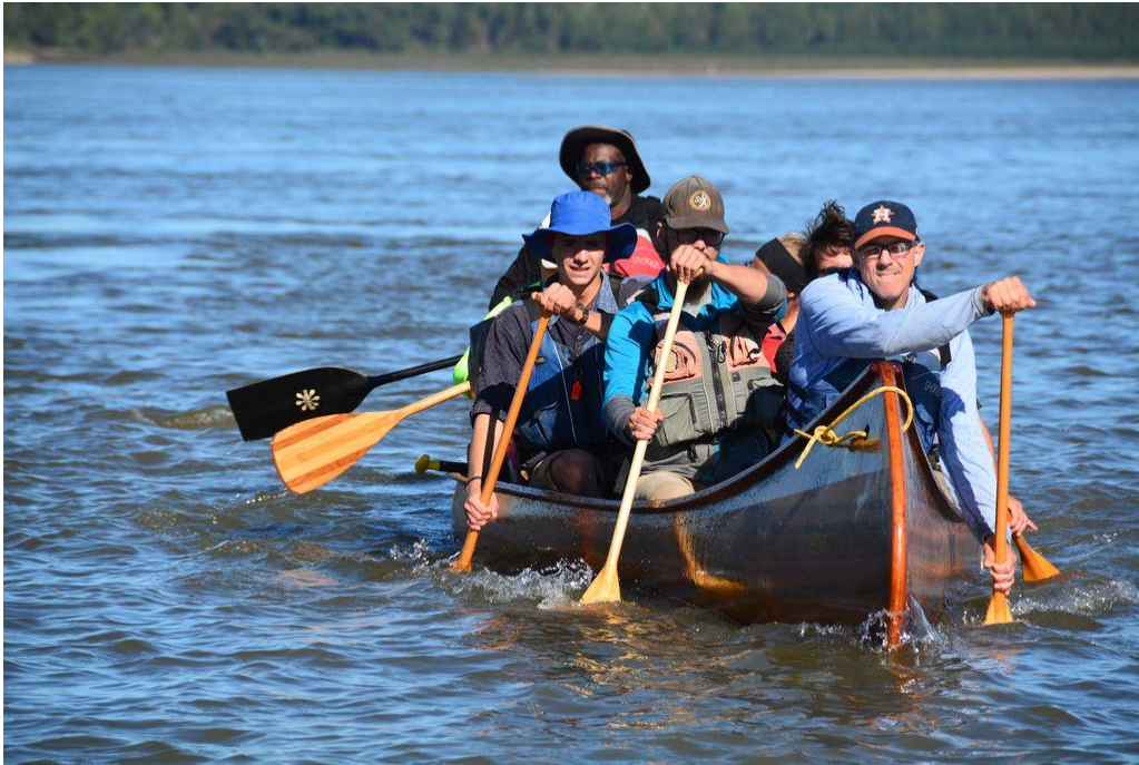
Many hands for make a successful class (Augsburg College River Semester 2015)

"Twenty years from now you will be more disappointed by the things that you didn't do than by the ones you did do. So throw off the bowlines. Sail away from the safe harbor. Catch the trade winds in your sails. Explore. Dream. Discover."