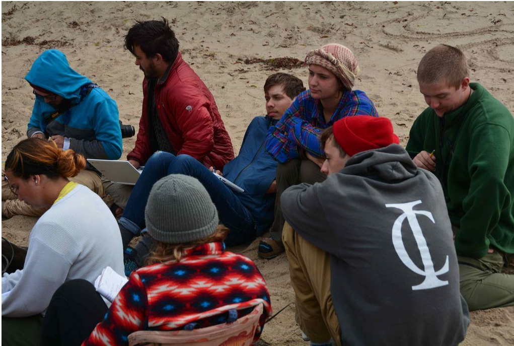
Morning Seminar Continued (Augsburg College River Semester 2015)