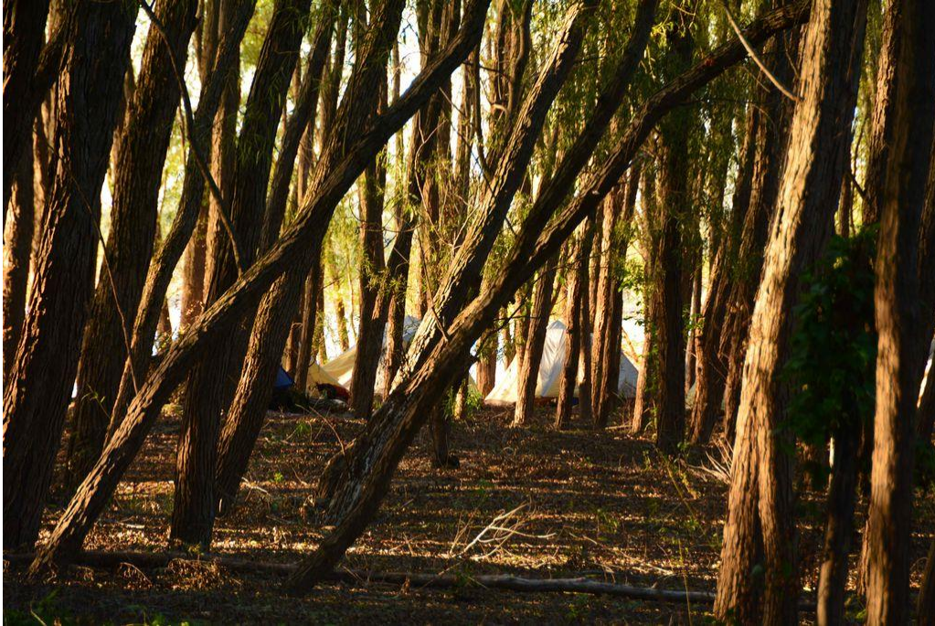
Willow Camp (Augsburg College River Semester 2015)

Clarksdale, Mississippi ~ Helena, Arkansas