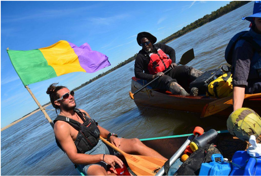
Meeting old friends in the middle of the river! (Augsburg College River Semester 2015)

3) Be sure to check out Two cool job postings for helping make the earth a healthier place, one from our partners at the Leave No Trace Center for Outdoor Ethics , and the other from the 1 Mississippi Campaign .