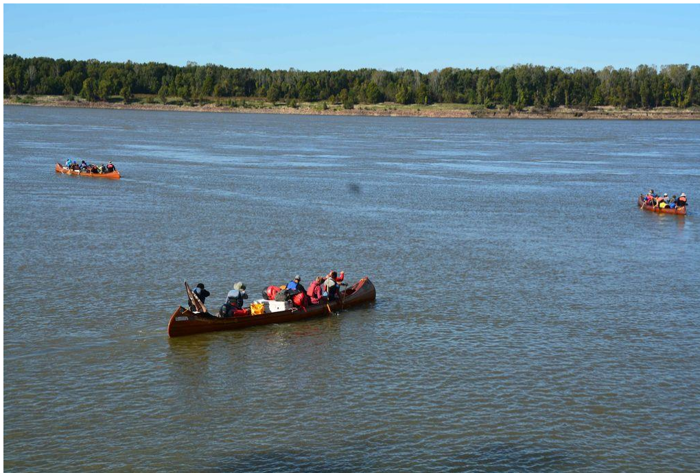
Voyageur canoes circle out of eddy and head downstream (Augsburg College River Semester 2015)

We are going into the wood shop in and will be building several voyageur canoes this winter. We need your 2 qt (or 32 oz) plastic yogurt containers! Cottage Cheese containers would work well. And also any other containers or bowls about that same size for mixing epoxy resin. Smooth edges and rounded bottoms are best for the purpose. Clean them out and bring to us in downtown Clarksdale, or box and send to Quapaw Canoe Company, 291 Sunflower Avenue, Clarksdale, MS, 38614. It will take us 4-6 months to finish these canoes. Anytime between now and June is good. Save your smooth plastic containers for us until June. Thanks! Free Mississippi River Connects Us All Poster to anyone who brings us cleaned out yogurt containers!