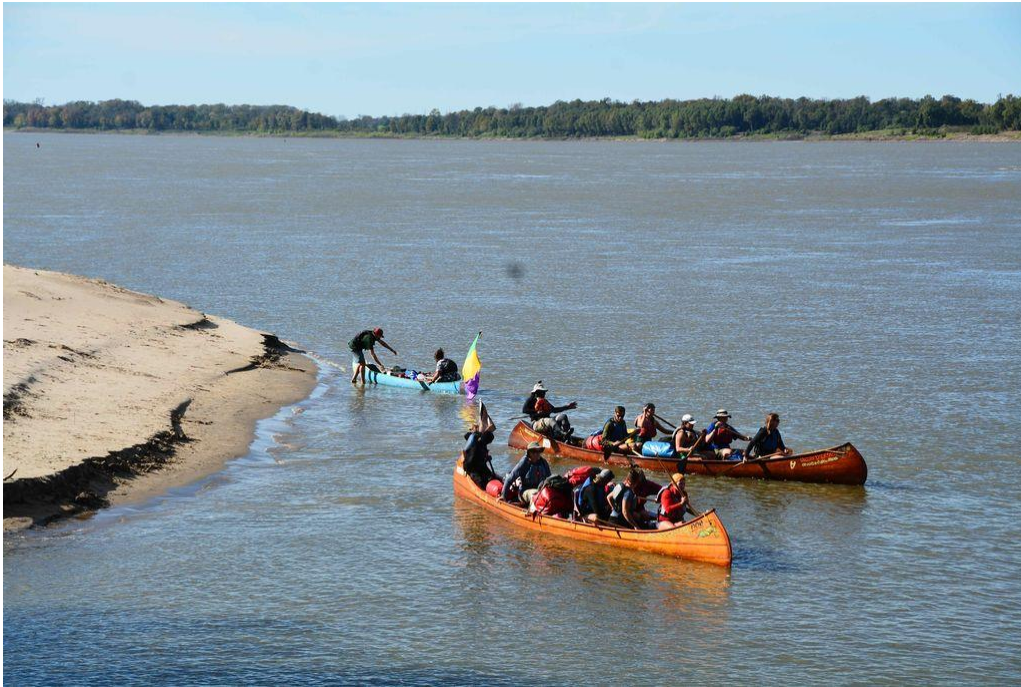
Push off after lunch (Augsburg College River Semester 2015)