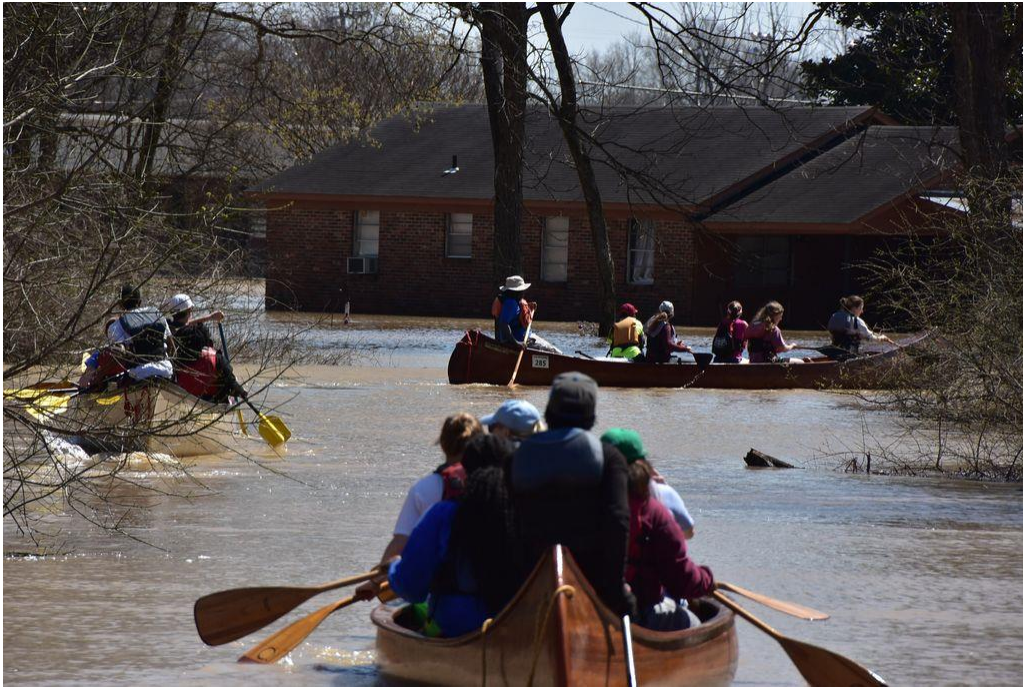
MSU ALternative Spring Break Volunteers in the Flood

Rebuilding: And then begins the reconstruction of the cave. We will have to rebuild kitchen, meeting room, bathroom, central office, library, outfitting, and storage. A lot of people are wondering how they can help. Well, here's how! You can help us by supporting the reconstruction of our community.