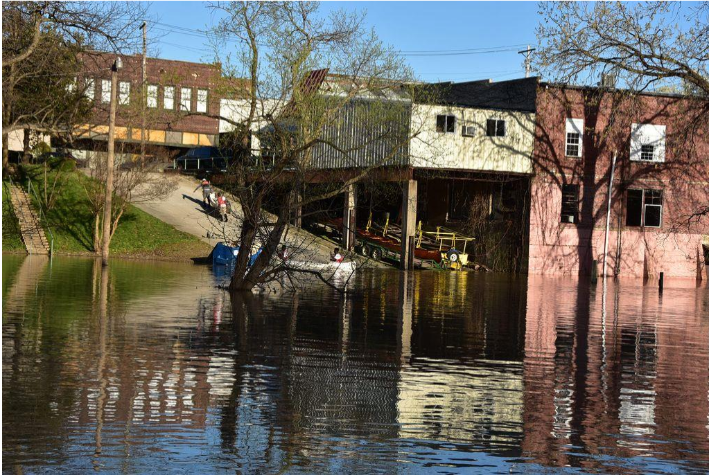
Our Temporary Boat Ramp