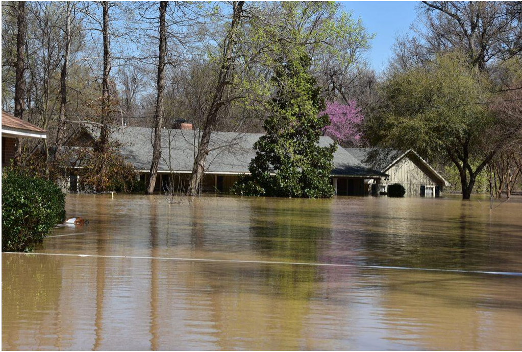
A Flooded Clarksdale Neighborhood

How can you help? Over 300 homes and businesses in Clarksdale suffered this flood. Go to the Red Cross or the Clarksdale Flood Relief Hub Web Site for volunteering and donations. If you want you can support our recovery at Quapaw Canoe Company Flood Recovery . We have been posting photos and information on our Facebook Page . Thanks to everyone for your many thoughts & prayers!