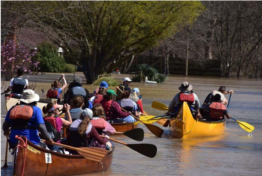
MSU ALternative Spring Break Volunteers in the Flood

Thanks to everyone for your phone calls, emails, and messages of consolation and hope! Over 300 Clarksdale homes and businesses have water in them. We will survive this thanks to our strong community and the good spirit of all of our friends, family and relations all around us! Our paddles up to all of you from all of the Mighty Quapaws!