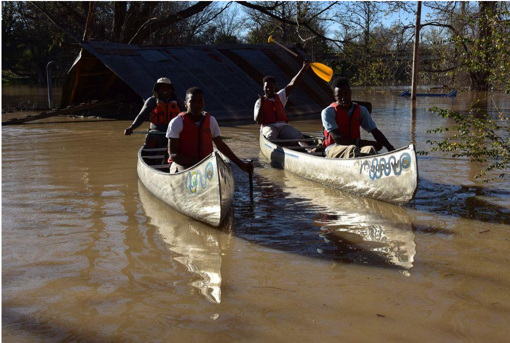
GRIOT ARTS paddling the March 2016 Flood

Please Note: We will have a "WE SURVIVED THE SUNFLOWER RIVER FLOOD" Party tonight (Friday Mar 18th) 6-7pm on the Kremser Plaza Porch next to our building at 3rd & Sunflower with music and slide show. Rain date: inside storefront at 289 Sunflower Avenue. The water is very slowly dropping, so you will be able to witness the flood firsthand, if you haven't already. Take a canoe, kayak or paddleboard and go explore. We will be giving guided tours of the hole we cut in the ceiling to make our escape. Go to our Facebook Event Page for more details.