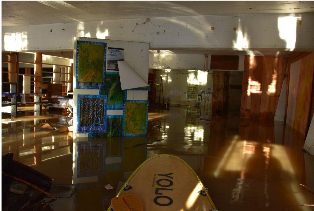
The Cave... No More

Cleanup: The good news: the river crested on March 17th and is now dropping. It has fallen maybe one foot as of this morning. The bad news: now begins the awful messy stinky cleanup. Toxic mold has already taken hold inside the cave. The cleanup will require a complete gutting of the cave. After removing all walls, wood items, and everything that can be moved, we will have to plow and then power wash all of the mud out of the cave. Then we will have to very carefully sanitize the floors, walls and ceiling in an effort to remove all pathogens, fungal growth, and anything else of possible harm to future use.