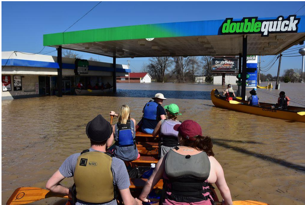
MSU ALternative Spring Break Volunteers in the Flood

How else can you help? Please know we are still fully functional for guiding and outfitting. We saved all of our canoes, paddles, pfds (life jackets), drybags, dutch ovens, tents, sleeping bags, and all the necessary camping and canoeing equipment. Another way you can help support our survival is by booking a trip with us!