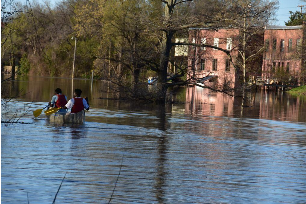
GRIOT ARTS paddling the March 2016 Flood