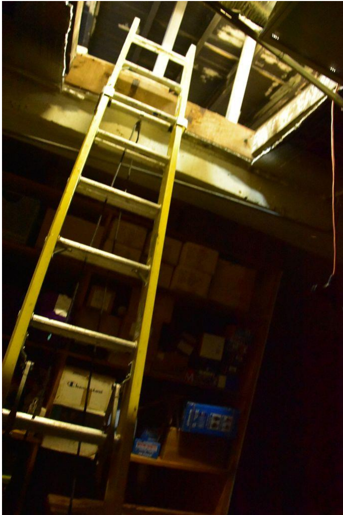
Our Escape Route

Our rescue route: It was a tense situation for us -- the fast rising waters early Thursday morning (March 9th) caught us flat-footed. Our upstream gage has stopped working, but just downstream of us the Sunflower rose about 25 feet in 24 hours, to highest ever levels. We had to cut a hole in the ceiling to get out. Thanks to Lena and 15 Pennsylvania HS students with Habitat for Humanity for coming to our rescue!