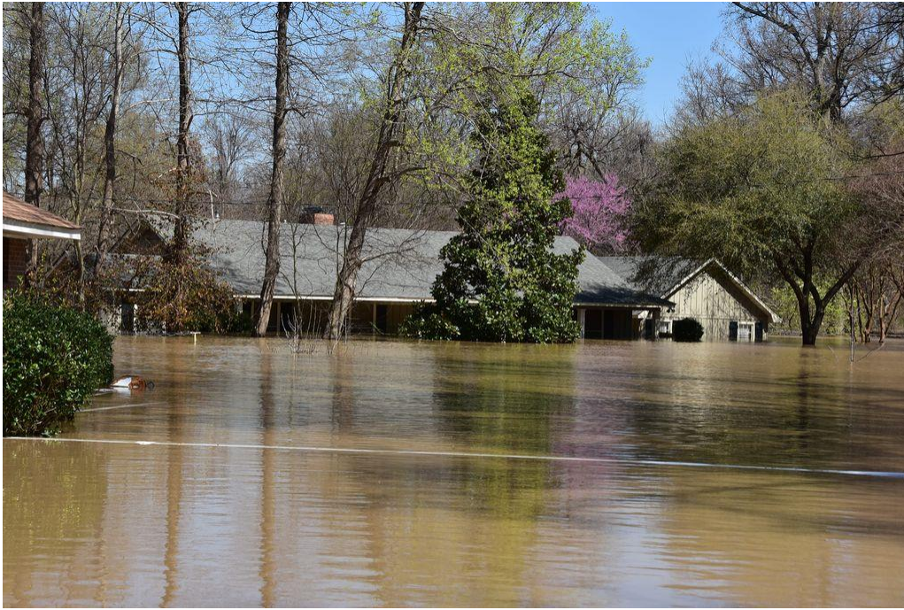
Flooded Homes in Clarksdale Duckwalk Neighborhood