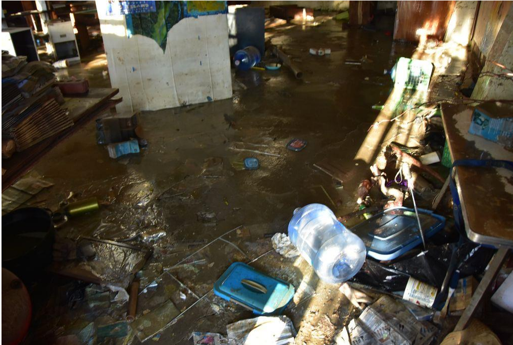
The results of the Sunflower Flood in Quapaw Canoe Company Headquarters... Our beloved "Cave..." Now no More... Until its Re-Birth that is! We will rebuild!

We've always said "The River Connects Us All" and we found out last week just how intimate that connection sometimes is.