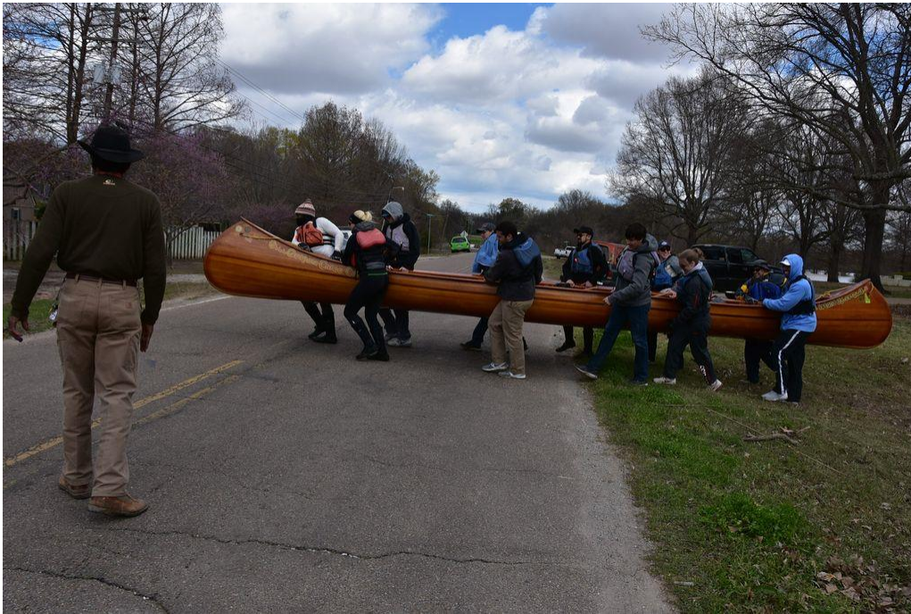
It takes many hands: Ole Miss portages big canoe across Friars Point Road

We Survived the Flood ...and now the Work Begins!